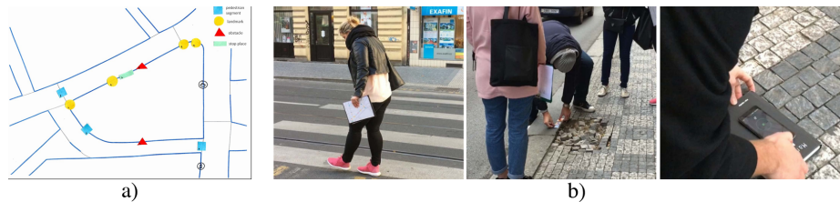
Fig. 1. a) A map representing template of the GIS – shapes depict features for which the attributes were collected; b) examples of measuring methods used.

name depicted features and collect data about their accessibility attributes. We were interested mainly in the shapes of corners, properties of crosswalks (such as a presence of tactile pavement, audio signalization, a presence of ramp or curb), positions of obstacles, passable widths, slopes and materials of pedestrian segments and properties of tram stops.