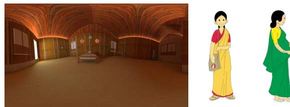
Fig. 1. (a) Virtual (360 degree) environment of Assamese home (b) persona of ASHA baidew and (c) persona of Meera

Pragati is a mobile phone based VR interface aimed at training and educating ASHAs in Assam, India. We created a 360 degree virtual environment of a traditional Assamese home where the modules are demonstrated. Audio-visual animations related to maternal and child healthcare were created in local Assamese language. We designed two personas ‘ASHA baidew (sister)’ - who moderated and guided users through each module and ‘Meera’ - who enacts as the woman going through pregnancy to increase familiarity and acceptance among users. Figure 1 (a), (b) & (c) show-cases virtual environment, ASHA baidew and Meera respectively. Information was presented in a mobile phone mounted on a Google cardboard. This is due to its lower cost and potential scalability among targeted user group.