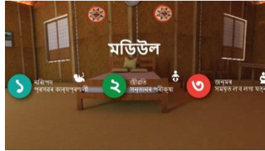
Fig. 3. Proposed horizontal menu user interface for Pragati

We designed Pragati for mobile based VR mounted on a Google cardboard (or similar cheap cardboards) to increase scalability. Hence, our proposed interactions are limited to fuse button mounted on Google cardboard. Users select the given options by pressing the fuse button multiple times i.e. tap once to choose option one, tap twice to choose option two and tap thrice to choose third option. We presented audio instructions to aide in choosing relevant options. A horizontal menu selection user interface was presented to choose relevant options. The menu selection options were tracked and presented to user irrespective of head position. Figure 3 showcases the horizontal menu user interface proposed in Pragati .