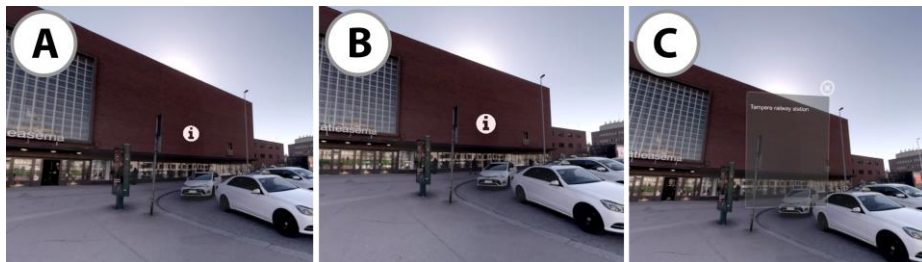
Figure 1. Interaction with hotspots. A: A hotspot is embedded on a building. B: The user focuses the hotspot at the center of the viewport, and the hotspot starts growing to visualize dwell time. C: The hotspot is triggered, and the content is shown.

In this section, we present iODV applications based on which we present our guidelines later in this paper. The use cases vary from entertainment to navigation and industrial use, and were carried out in collaboration with several large industrial companies and cultural institutions.