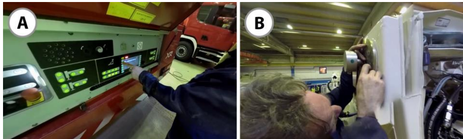
Figure 4. Situations where embedded content is needed. A: A technician operating a large control panel. B: A technician adjusting a small part of a crane, blocking the view with his hands.

Some low-level details and procedures are difficult to present with ODVs. For example, in industrial context, we aimed to record ODVs of maintenance procedures, to be used as reference material and documentation for future maintenance technicians. We found that capturing the fine details of the procedure, such as interacting with a complicated control panel in a correct way, was problematic. Primarily, it was difficult to place the camera close enough to show that much detail properly (Figure 4A). Moreover, the technician conducting the procedure would often obstruct the object from the camera (Figure 4B). In these situations, the role of embedded content, such as pictures, text, and 2D video, is emphasized, to better visualize the details. It is also worthwhile to note that with embedded content (hotspots), one can better guide the user's attention to meaningful objects and events, without the need to rely on the user to always know what to focus on. While Argyriou et al. [1] argued that the UI should be subtle and non-intrusive, in some cases, more disruptive elements could be utilized if it is important to direct the user's attention towards certain elements which she might not otherwise notice. This would be the case in scenarios with a more focused narrative, such as the aforementioned maintenance procedures.