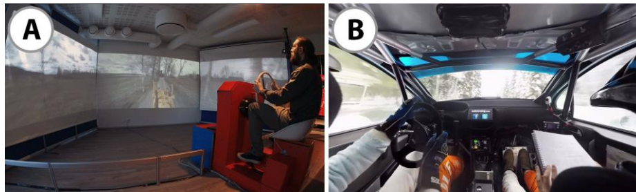
Figure 2. Simulators using ODV content. A: A road grader simulator where the video is projected on the wall using three projectors. B: Rally car simulator used with a VR headset.

ways compared to the industry demos presented earlier. In the road grader simulator, the presentation of iODV content is changed based on user interaction, by rotation, or by adding effects to the video to simulate faster speed. In the rally simulator, the interactivity is limited to starting the rally session, as it is more concentrated on immersion and the experience of rally driving, which most people have no other chance of experiencing. In the next version, we will provide the user with more interactive content such as information on the route driven.