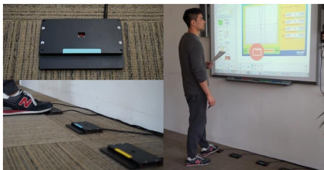
Fig. 1. FeetForward: a foot-based peripheral interface to support teachers' use of interactive whiteboards. See [14] for a demo video.

With the purpose of exploring how new classroom technologies can be designed to become peripheral and routine for secondary school teachers, this paper presents the research-through-design [12] study of FeetForward, a foot-based peripheral interface to facilitate secondary school teachers' use of interactive whiteboards (See Figure 1). We have deployed this simple yet new technology with three secondary school teachers in their classrooms for a period of five weeks. In this study, we used FeetForward as a technology probe [13] to gather implications for the design of peripheral classroom technologies. In particular, we aimed to study how FeetForward as a peripheral interaction design, could impact pedagogical activities, what may influence a new classroom technology to integrate into teacher's routines, and whether foot-based interaction styles were suitable for peripheral interaction.