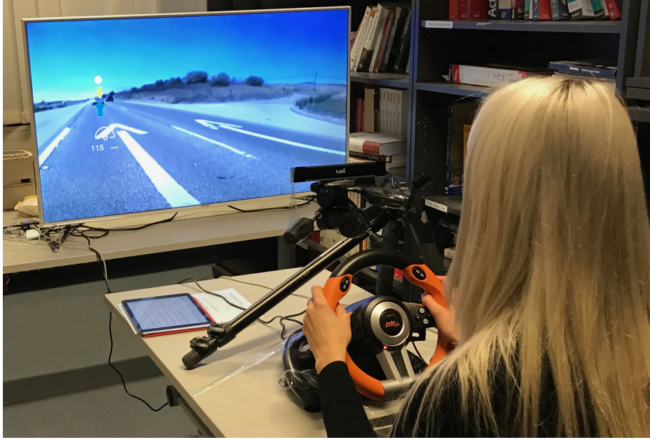
Fig. 1. A participant on the baseline track with a permanently displayed speedometer.

driver being aware of it [?,?]. This is related to change and inattention blindness where the driver misses appearing or changing objects despite looking in their direction [?], e.g., driving directly into congested traffic without noticing [?].