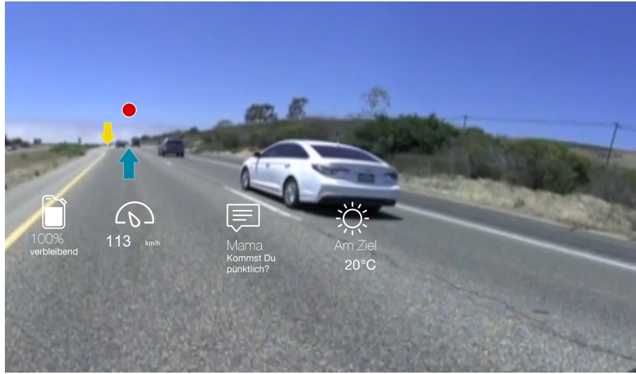
Fig. 2. An example view of the driver. The driving simulator software runs an adjusted version of the ConTRe task and footage of real driving with superimposed HUD content.

The HUD information was placed in an area of -6^\circ to 13^\circ horizontally and -3^\circ to 6^\circ vertically. The vanishing point of the street constitutes 0^\circ . These values also defined the gaze-sensitive area; a glance into this area superimposed the HUD content. In both information on demand conditions, the content was superimposed with a defined delay of 300 ms in order to avoid unintended display due to uncontrolled glance behavior. When the driver's gaze left the sensitive area or the shift paddle was released, the content remained visible for an additional 500 ms before it blanked out. The position of each piece of information is the same in each condition in order to avoid confusion or an implicit evaluation of the information placement: gas at -4^\circ , speedometer at 0^\circ , message at 6^\circ , weather at 12^\circ horizontally (corresponding to the center of the item).