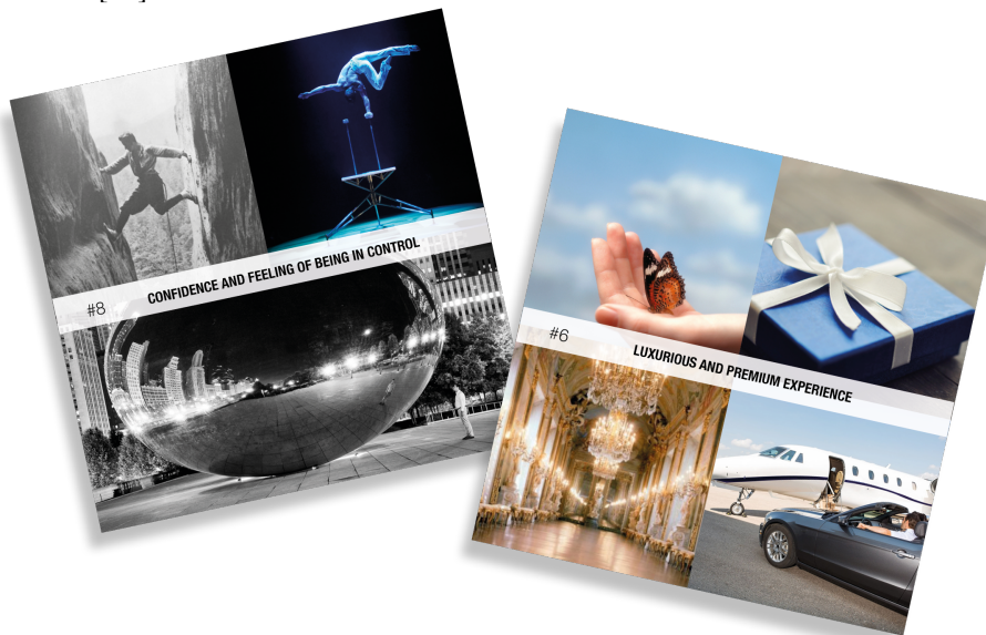
Figure 1. Examples of the Context Cards: on the left, the card of Confidence and feeling of being in control and on the right, the card of Luxurious and premium experience.

In order to better understand the bus passengers needs and expectations, and to ideate services, we conducted three co-design workshops. In co-design, users are invited to participate to the design activities together with design professionals in a continuous cooperative process that results in better solutions for daily life [23, 24]. In co-design, users are treated like experts, but since they often have very little experience on innovation it is important to provide materials that support the ideation activities [23]. The co-design materials, such as workshop tools can provide different entry points to the design problem as well as help the participants to build their own design language [14]. These co-design methods suit best for the early phases of the design process, e.g. for idea generation through brainstorming new ideas, or when rethinking existing solutions [14].