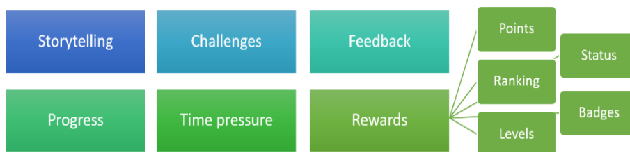
Fig. 2 Serious game mechanism [28]

In the following, with regard to the use case, we will focus on challenges, feedback and progression. Playing a game confronts the player with a certain uncertainty and suspense. The mastering of tasks in increasing levels of difficulty pose a challenge for users. The intrinsic motivation, especially of ambitious players but also of those players with a weak ambition, is affected by cognitive challenges. Feedback, which is bounded to the need for recognition, is another motivating mechanism. Other than challenge, feedback is affecting the extrinsic motivation. It enables the recipient to reflect and contextualize its own work. This way, feedback supports the learning progress and motivates the player at the same time. Progression, too, is supporting the reflection of performance. Progression in serious games can be adapted in different contexts. On the one hand, it may be used in form of a progress bar which shows the achieved but also the forthcoming efforts. On the other hand, it can be applied in form of a curve that illustrates skill improvements and achieved mile stones. This way, gaming mechanisms like feedback and progress impart a feeling of competence and positively affect self-reported learning outcomes [29]. All three components, challenge, progression and feedback, positively affect users motivation and are therefore appropriate mechanics for Serious Game in a corporate context.