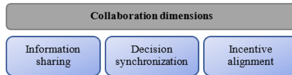
Fig. 2. Collaboration dimensions

and operational decisions jointly; and, the incentive alignment consists of the degree of sharing costs, risks and benefits between supply chain members.