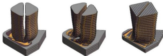
Fig. 2. Examples of designs generated using Generative Design.