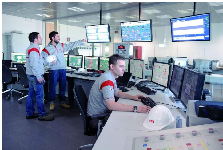
Fig. 1. Illustrative photo of a control room with operators and their workstations running applications with HMI

assembled from standardized software components such as editors, compilers, and export and import utilities, with open interfaces for repeated functionality. Tools that were previously provided as separate and distinct modules, for example, human-machine interfaces (HMIs), simulation and/or visualization modules are now standardized interfaces of control systems, see the photo in Fig.1 showing the control room with operators and their workstations.