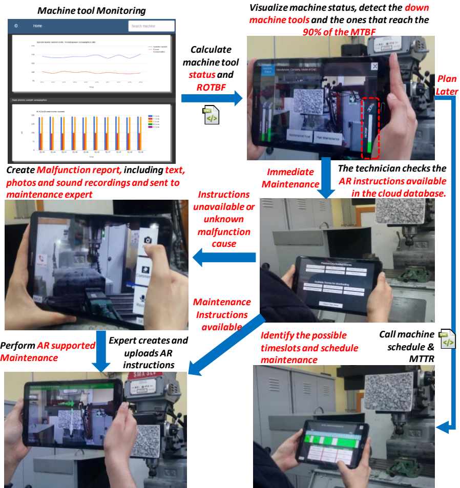
Fig. 3. Application of the developed framework

plans a maintenance task based on a breakdown that may occur, without considering any data from the machine tool. The maintenance department is informed on the maintenance issue and deploys the maintenance expert to go on spot to diagnose the issue and physically perform the maintenance task in the production plant. In an effort to eliminate this need and reduce maintenance time and cost, the proposed system is applied. The developed monitoring system considering the data acquisition device and the WSN was set up. The monitoring system gathered all the necessary data to identify the machine tools status, the actual machining time, as well as the ROTBF.