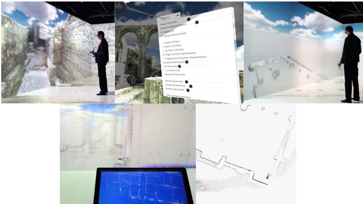
Figure 3: « Cutting plane » creation process by an operator in the Immersia platform.

We now need to have the tool tested by a large community of archaeologists, in particular to check if the use of the Flystick to move the cutting plane is sufficiently precise. At the same time, we still have to improve the optimization of the point clouds management. Concerning the reduction of the I/O time and disk space, it will be necessary to store the points coordinates on 2 bits (instead of 4), to downgrade the precision to the millimetre unit, to decrease the entropy, and to use zstd compression. The use of culling