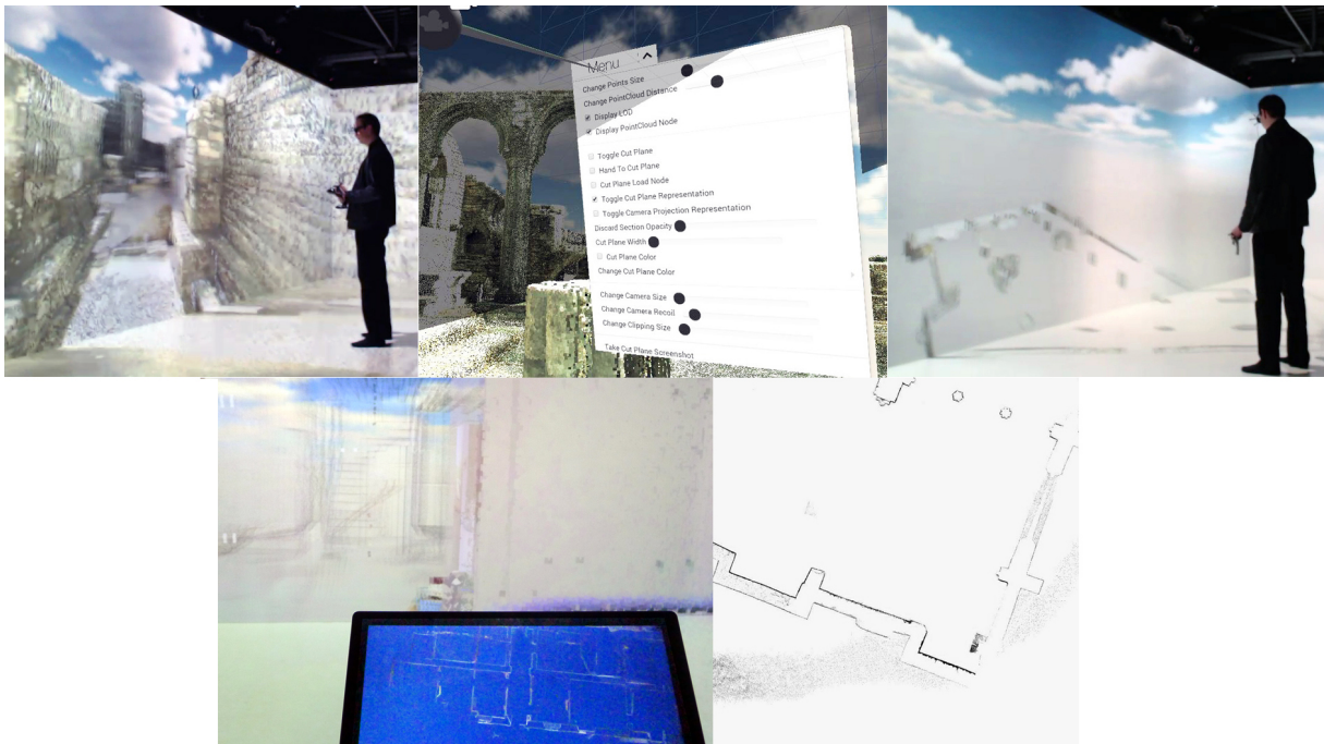
Figure 3: « Cutting plane » creation process by an operator in the Immersia platform.

We now need to have the tool tested by a large community of archaeologists, in particular to check if the use of the Flystick to move the cutting plane is sufficiently precise. At the same time, we still have to improve the optimization of the point clouds management. Concerning the reduction of the I/O time and disk space, it will be necessary to store the points coordinates on 2 bits (instead of 4), to downgrade the precision to the millimetre unit, to decrease the entropy, and to use zstd compression. The use of culling