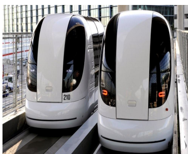
Fig. 1: ATN' vehicles 3

In this paper, we focus on the multi depot one-to-one PDP with distance constraints by studying its real world urban on-demand passengers transportation application. In fact, there is several transportation systems that are designed to move people in urban areas. Examples of these systems include subway, bus, train, bus rapid transit (BRT), light rapid transit (LRT), automated transit network (ATN) and so on.