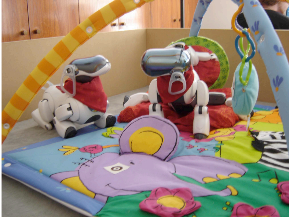
Figure 4 Curiosity-driven learning and self-organization of developmental structure in the Playground Experiment 22,28 . The robot in the center explores and learns to predict the effects of its actions, driven by an intrinsic motivation mechanism that drives it to focus on sensorimotor experiments that maximize learning progress/information gain. At the short time scale, this constitutes a model of curiosity-driven attention pushing the robot to prefer sensorimotor contingencies of intermediate complexity, compatible with recent experiments studying informational preferences in infants (Kidd et al., 2012). When running over an extended period of time, one observes the spontaneous self-organization of developmental phases of increasing complexity, without an initial program that specifies these phases. For example, the robot learns on its own to grasp an object in front of it, and later on focuses on exploring how to produce vocalizations that elicit reactions in another robot.

Several research teams have proposed to advance our understanding of curiosity and its impact on development by fabricating robots that learn, discover, and generate their own goals with formal models of curiosity-driven learning 19-21 . An example comes from the Playground Experiment (see Figure 4 and video https://www.youtube.com/watch?v=uAoNzHjzzys 21,22 ). Here, a robot learns by conducting experiments: it tries actions, observes effects, and detects regularities between these actions and their effects. This allows it to make predictions. The way the robot chooses actions is like a little scientist: it chooses experiments that can improve its own predictions, which can provide new information, which makes learning progress, while continuously allocating some proportion of time to exploring other activities in a search for new possibilities. The robot is also equipped with a mechanism that simultaneously categorizes its sensorimotor experiences into different categories based on how similar they are in learnability and controllability.