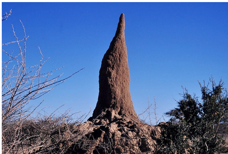
Figure 2 The architecture of termite nests is the self-organized result of local interactions among thousands of insects. None of these insects has a map of the architecture. Computer simulations contributed to understanding this process. Today, models in developmental robotics are used similarly to study how local short term mechanisms can give rise to macro and long-term behavioral and cognitive developmental structure.

Child development also involves the interaction of many components, but in a way that is probably orders of magnitude more complicated than crystal formation or termite nest construction. Hence, to complement the (tremendously useful) verbal conceptual tools of psychology and biology, researchers have begun building machines that model pattern formation in development. Such efforts can play a key role in 21 st century developmental science.