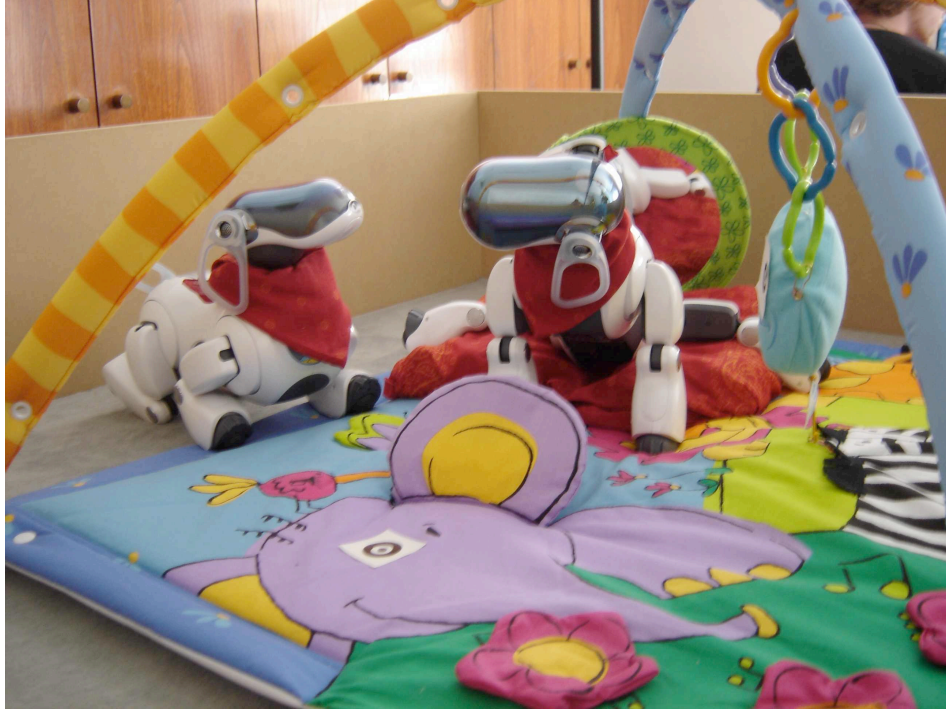
Figure 4 Curiosity-driven learning and self-organization of developmental structure in the Playground Experiment 22,28 . The robot in the center explores and learns to predict the effects of its actions, driven by an intrinsic motivation mechanism that drives it to focus on sensorimotor experiments that maximize learning progress/information gain. At the short time scale, this constitutes a model of curiosity-driven attention pushing the robot to prefer sensorimotor contingencies of intermediate complexity, compatible with recent experiments studying informational preferences in infants (Kidd et al., 2012). When running over an extended period of time, one observes the spontaneous self-organization of developmental phases of increasing complexity, without an initial program that specifies these phases. For example, the robot learns on its own to grasp an object in front of it, and later on focuses on exploring how to produce vocalizations that elicit reactions in another robot.

Several research teams have proposed to advance our understanding of curiosity and its impact on development by fabricating robots that learn, discover, and generate their own goals with formal models of curiosity-driven learning 19-21 . An example comes from the Playground Experiment (see Figure 4 and video https://www.youtube.com/watch?v=uAoNzHjzzys 21,22 ). Here, a robot learns by conducting experiments: it tries actions, observes effects, and detects regularities between these actions and their effects. This allows it to make predictions. The way the robot chooses actions is like a little scientist: it chooses experiments that can improve its own predictions, which can provide new information, which makes learning progress, while continuously allocating some proportion of time to exploring other activities in a search for new possibilities. The robot is also equipped with a mechanism that simultaneously categorizes its sensorimotor experiences into different categories based on how similar they are in learnability and controllability.