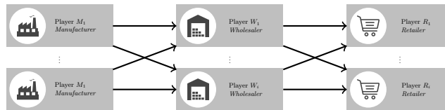
Fig. 1. Game of Trust Supply Chain

One component of interest in the initial phase was the supply chain. The Beer Game uses a four tier supply chain, where each tier is assigned exactly one player. Considering the intention to include and measure the trusting behavior of participants, such a simple supply chain construction has been identified as a severe limitation. The underlying reason is that the player at each tier is forced to interact with his/her direct neighbors. While this is sufficient for interaction, the degree of risk and uncertainty - which are required properties for trust [4] - can assumed to be low or non-existent. To sanitize this issue and in order to create a market place closer to the real world [5], the decision was made to change the original Beer Game supply chain structure. Accordingly, the GAME OF TRUST will allow multiple players at each supply chain tier (see Fig. 1). Furthermore, the Distributor tier has been removed. While this tier helps to