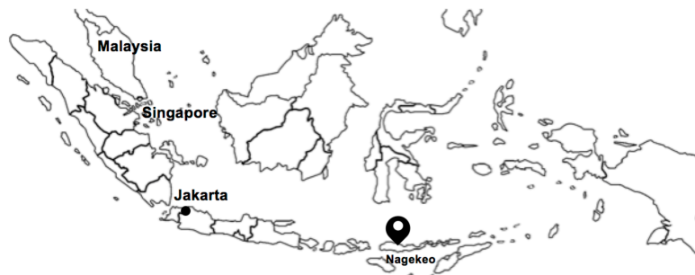
Figure 2. Map of Nagekeo: The study site

Our study site is the district of Nagekeo located in the province of East Nusa Tenggara (see Figure 1). Approximately 110,000 people inhabit this area, which covers 1,417 square km. This newly established district was part of the district of Ngada until 2007. A large proportion of this district's land is community land (tanah ulayat) without certificates. That often triggers land conflicts, either between tribal groups or between tribal groups and the local government [31, 32]. Nagekeo was selected in order to represent an area where conflicts concerning community land ownership are prevalent.