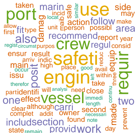
Figure 2. This is a word cloud of the one hundred most frequent terms in the MAIB Corpus. The terms have been reduced to their stem using the SnowballC stemming algorithm.

For the exploration of the corpus we created a document-term-matrix of the corpus and checked the most frequent terms. Furthermore this enabled us to check term correlations in the corpus. We used R version 3.2.4 with a number of text-mining packages to perform this. The creation of the document-term-matrix requires some further pre-processing in R. The following pre-processing steps were conducted on the data-frame in R, only. We removed URLs, punctuation, numbers, standard English stop-words