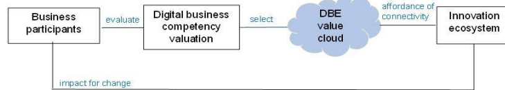
Fig. 1. A conceptual model of ODBE

DBE is seen as a disruptive business infrastructure at the business strategy and policy level but still it is a lack of a methodology in facilitating the participation of multiple companies. Therefore, the ODBE model introduced in this paper aims to facilitate open innovation that enables an alignment between open innovation and value co-creation in a manner of self-evolving and self-managing towards co-development of products [16]. Fig. 1 depicts a conceptual architecture of ODBE that consists of four key functional components: 1) the business participants and their digital business capabilities, 2) the Digital business competency valuation, 3) DBE value cloud, and 4) an Innovation ecosystem.