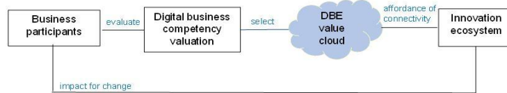
Fig. 1. A conceptual model of ODBE

DBE is seen as a disruptive business infrastructure at the business strategy and policy level but still it is a lack of a methodology in facilitating the participation of multiple companies. Therefore, the ODBE model introduced in this paper aims to facilitate open innovation that enables an alignment between open innovation and value co-creation in a manner of self-evolving and self-managing towards co-development of products [16]. Fig. 1 depicts a conceptual architecture of ODBE that consists of four key functional components: 1) the business participants and their digital business capabilities, 2) the Digital business competency valuation, 3) DBE value cloud, and 4) an Innovation ecosystem.