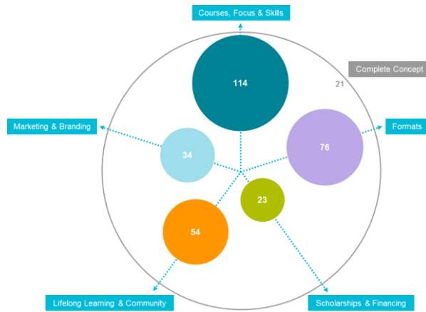
Fig.3.: Submitted ideas per category