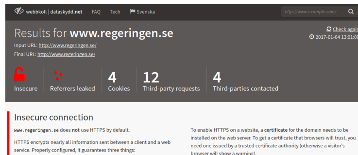
Fig. 3. Screenshot of part of results page for regeringen.se, the website of the Government Offices of Sweden.

We also explain what these things are and what one can do and why. Additionally, we check for certain third-party services (such as Google Analytics and Disqus) and suggest alternatives.