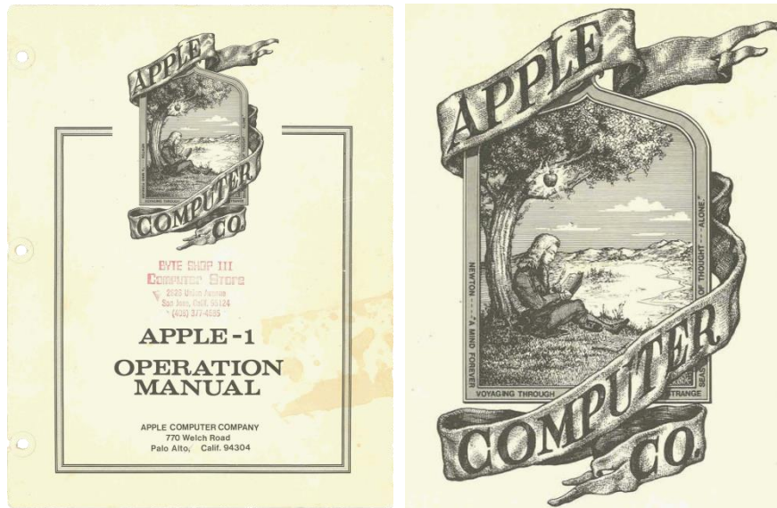
Fig. 2. The cover of the Apple-1 user manual, and the detail of the logo

age the editing of all other types of objects in the KB. Thus, the content of the KB is authoritative and the KB is a tool that helps in the cataloguing of new acquisitions – the Apple-1 is a simple case, but other IST artefacts have versions, variants, production batches and are quite difficult to be properly identified.