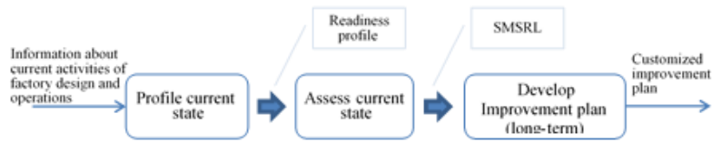
Fig. 1. Overall assessment framework

Erro! Fonte de referência não encontrada. provides an overall architecture of the readiness level assessment. It summarizes the steps, the inputs, and the outputs involved in the assessment followed by improvement plan development. The process is iterated after the plan has been implemented. The primary purpose of the proposed assessment based on the SMSRL index is to 1) help manufacturers determine their current level and 2) develop a customized improvement plan.