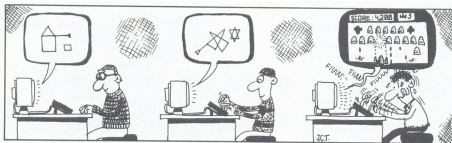
Fig. 1. ‘TodoSpectrum’ magazine, May 1985 [14: p.13].

when tinkering with their computers. Regarding this, Gerard Alberts and Ruth Oldenziel note that ‘playfulness was at the heart of how European players appropriated microcomputers in the last quarter of the twentieth century. [...] Users playfully assigned their own meanings to the machines in unexpected ways’ [13: p.1]. The following cartoon, taken from a 1985 Spanish computing magazine, is a suitable example of how playfulness was experienced whenever some of the users sat in front of their computer screens: