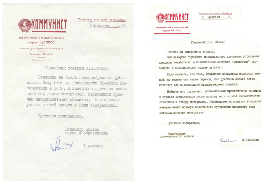
Fig. 3. Letters from “Communist” journal.