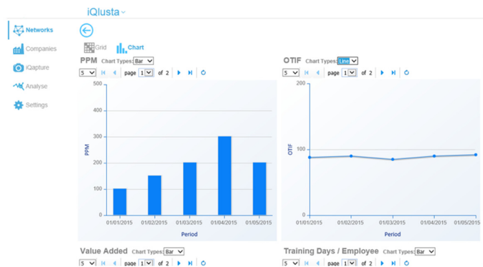
Figure 3 - Display of performance monitoring features