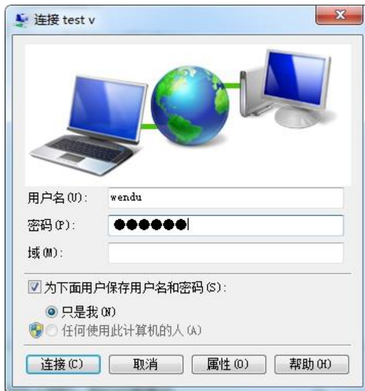
Fig. 2. Input user name and password

Client using the Windows operating system test, and can easily show as a result, the input connection of the user name and password, as shown in figure 2