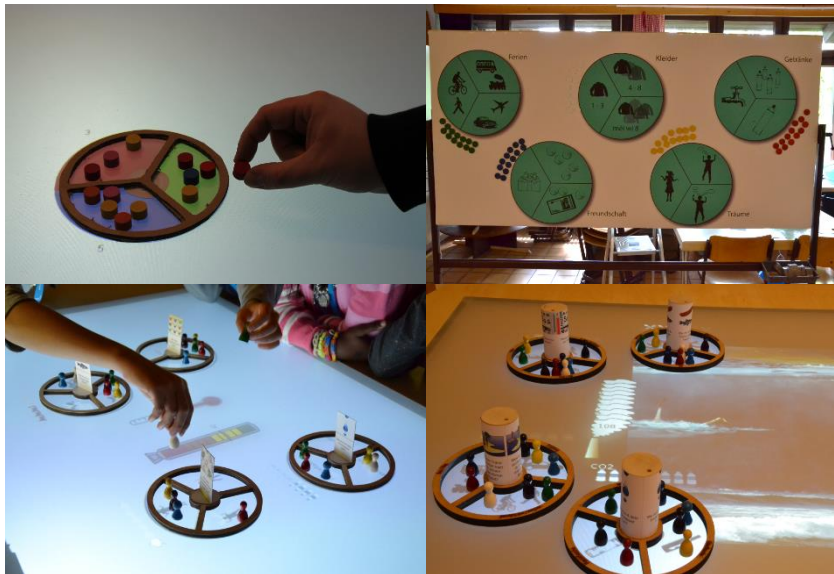
Fig. 1. The Tangible Voting technique has been developed in four iterations

The TUI was designed in a multidisciplinary design group across several competencies, covering Software Engineering, Interaction Design, Graphic Design, and Pedagogy. In this group we iteratively designed the widgets, the visual feedback, the selected parameters of daily life decisions, the underlying equations describing the effects onto the environment, and the scenario of use as part of one-day workshops on Climate Change. Intermediate designs were first visualized as sketches, and then implemented as low-fidelity prototypes that were improved in each iteration. Each of these was then discussed and refined collaboratively in the design team. Two of the preliminary versions were further tested with several groups of children.