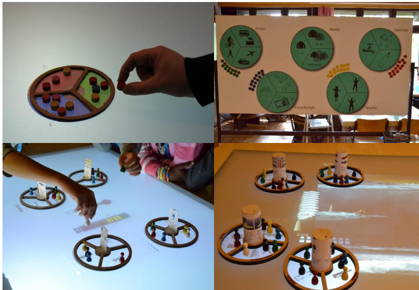
Fig. 1. The Tangible Voting technique has been developed in four iterations

The TUI was designed in a multidisciplinary design group across several competencies, covering Software Engineering, Interaction Design, Graphic Design, and Pedagogy. In this group we iteratively designed and the widgets, the visual feedback, the selected parameters of daily life decisions, the underlying equations describing the effects onto the environment, and the scenario of use as part of one-day workshops on Climate Change. Intermediate designs were first visualized as sketches, and then implemented as low-fidelity prototypes that were improved in each iteration. Each of these was then discussed and refined collaboratively in the design team. Two of the preliminary versions were further tested with several groups of children.