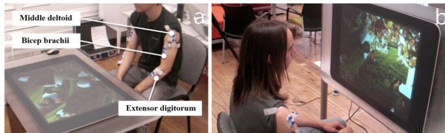
Fig. 1. The experimental set up for the horizontal (a) and vertical (b) configurations

Eighteen males, who were familiar with multi-touch technology and were free of musculoskeletal disorders, took part. The mean age was 26.4 ( \pm 4.6 ). Three were left-handed. The tabletop was raised to a height of 26" using wooden panels to allow comfort and participants sat on a chair 18" in height (Figure 1a).