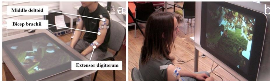
Fig. 1. The experimental set up for the horizontal (a) and vertical (b) configurations

Eighteen males, who were familiar with multi-touch technology and were free of musculoskeletal disorders, took part. The mean age was 26.4 ( \pm 4.6 ). Three were left-handed. The tabletop was raised to a height of 26" using wooden panels to allow comfort and participants sat on a chair 18" in height (Figure 1a).