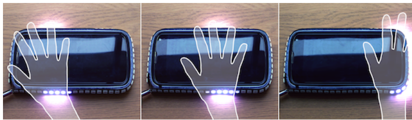
Fig. 2. Varying brightness at different locations to show hand position.

We have found dynamic change in brightness to be especially effective for gesture feedback, as users immediately see a response to their hand movements. One of our feedback designs uses brightness to show how well users’ hands and gestures can be sensed, using a visibility metaphor: when light is easier to see (that is, brightness is greater), it is because hands can be more easily seen (Figure 1). If light is less visible, it is because users are not as easily sensed; for example, their hands may be too far from the sensor.