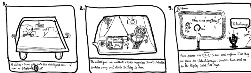
Fig. 1 IDA story board

The car parks are by default ranked on the distance proximity to the driving location. However, the driver can change this setting using speech or the touch screen, as shown in figure 2C. If the driver dislikes the suggestion, he/she can request other parking locations up to 3 times. After the third rejection IDA turns into manual mode. In the manual mode the driver can search by himself for available parking once the car is standing. If the number of available parking places is less than 20, the label designating the car park lots turns into red (figure 2B). The application warns the driver on the spot and offers parking alternatives. When the driver reaches the car park, IDA displays – on the right side of the screen - the floor map where the empty lots are marked in green. On the left side, the driver can request the application to send him/her an SMS with the exact parking location (figure 2D). The driver has the option to switch off the application at any moment in time by saying: “Dismiss”.