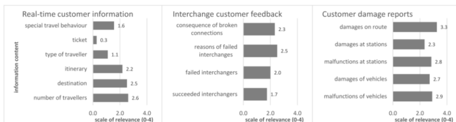
Fig. 2. Appraisals of the relevance of the content of automated customer feedback

The assessments of the relevance of customer information for dispatching decisions show considerable differences according to the type and content of information. For instance, the survey reveals that the real-time information about travelers is most relevant as an aggregation of the number of interchangers per connection (cf. fig. 2). Furthermore, additional information, such as destinations and itineraries of travelers, can provide valuable information about travel alternatives and allow conclusions about the prioritization and the characteristics of the required decisions. Direct customer feedback can not only comprise the success of interchanges, but also the reasons and consequences of failures from the travelers' point of view. Due to the fact, that this customer feedback could provide valuable data for the evaluation of the dispatching quality in retrospect, the relevance of this information is mainly rated moderately. In contrast to the previous customer information and feedback, the relevance of damage reports by customers is rated high and very high, especially by the dispatchers of regional transport companies. Due to the fact, that the regional dispatchers also often supervise the according infrastructure, such as tram wires and station facilities, these results indicate the highest acceptance and need of automated customer information.