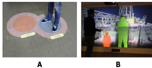
Fig. 3. Awareness techniques: (A) Floor circles. Remote and local users establish a social bubble. (B) Wall shadows depict two users. The larger shadow is the moderator.

Floor Circles: In the Eery Space prototype, every local and remote participant has a representative projected circle on the room's floor, as depicted in Figure 3A. All circles are unique, corresponding to a single person, and are distinguished from each other by a name (the participant's identity) and the user's unique color. These circles track a person's position within Eery Space, in order to visually define the participant's personal space, thus making all people aware of others. Thus floor circles provide the necessary spatial information for participants to initiate and be aware of proximity interactions. In addition, projected circles depict a user's proxemic zones. The inner circle, with a