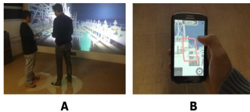
Fig. 4. Evaluation: (A) Test user interacting with the local participant during the evaluation session. (B) Handheld Client. User engaged in a sketch collaborative task.

We conducted a user evaluation to assess the interactions within the Eery Space, both with local and remote people. In our experiment, subjects were invited into the room with the main setup, while a remote user was in a room equipped with a lighter version with one Microsoft Kinect, one display showing the floor projection and a smartphone.