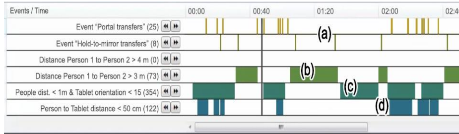
Fig. 3. Analysis generated through queries to the EXCITE tool.

video data, he notices that the “hold-to-mirror” events match up with times when participants are not close together. He generates the following query: