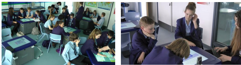
Figure 2: a) Classroom Camera b) Single Group Camera

The study was designed to investigate the relationship between students and the technology through their collaborative behaviours, and that between the teacher and the technology through her feedback and lesson plans. It was conducted over 4 sessions across a half term (6 weeks) in a UK secondary school classroom. The classroom was equipped with 8 smart tables, allowing 8 groups of 3-4 students to participate – 30 students in total. The students were native English speakers of mixed ability, studying English in Year 8 (aged 13-14, key stage 3). Each lesson was planned and facilitated by the class's usual English teacher, who also produced the session content. Sessions were scheduled to fit in with the existing timetable. The teacher met with the research team to discuss and improve the design before the study and had completed a collaborative writing task using CCW. She designed lesson plans to incorporate the technology into her teaching goals. 2-3 Researchers were present at each session, and sessions were filmed with a classroom camera and a single group camera (Figure 2). Before each CCW session, the students completed a collaborative exercise, either Digital Mysteries [10] (first 3 sessions) or a classroom debate (final session). The “in the wild” context also had significant practical ramifications, including: