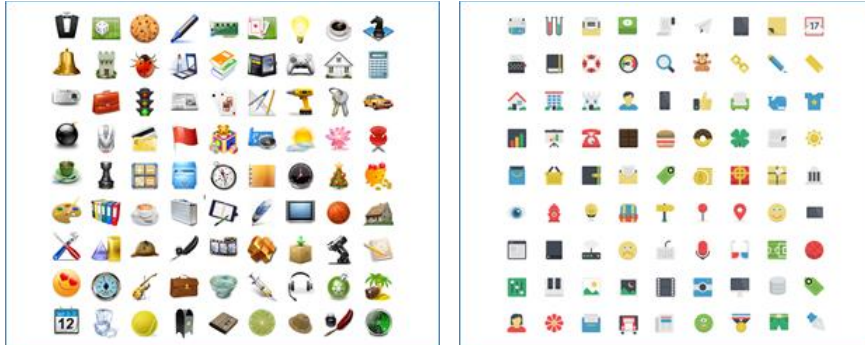
Fig. 2. Examples of realistic and flat icons stimuli

(3) A search for clickable objects (i. e. objects which change something on the screen after a click) on screenshots of existing websites (Fig. 3). The participants were instructed to click all screen objects that look clickable (buttons, links, menus, images, banners etc.).