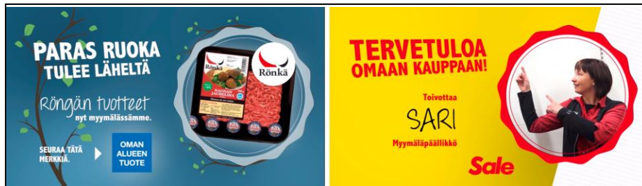
Fig. 2a&b. Examples of display content. In Fig. 2a the template is Background animation: the branches and leaves grow in the background. The content theme is 2) Local food. The text says ‘Best food is local – Rönkä’s products now in our store – Follow this sign > Local product’. In Fig. 2b the template is Fact animation: the text “Tervetuloa omaan kauppaan!”(i.e. Welcome to your own store!) appears when the store manager turns and points to her upper right. She also briefly looks further down at her name “Sari”. The content theme is 3) Familiarity with the store manager. The text says ‘Welcome to your own store! – Wishes Sari, the store manager’.

All digital displays utilized in the pilot were located indoors. In the grocery stores the displays were typically located quite close to a cash desk. In the supermarket they were located along the corridors. The displays were located quite high with the exception of one small display that was located on a lower level nearby a cash desk that was used only during the peak hours. All displays had rather large screens (about 50 inches), excluding the small display mentioned above.