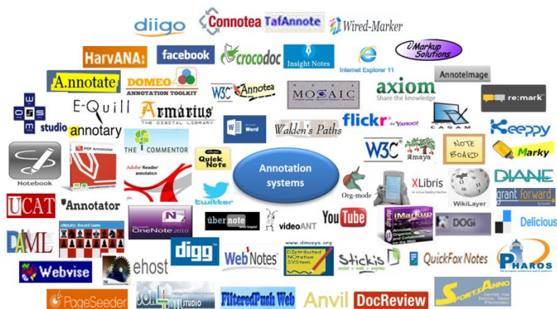
Fig. 1. Several annotation systems are developed in different contexts.

Annotation systems have been developed since the 90 th to transpose on electronic document the secular practice of annotation. Then, these systems have gradually taken advantage of processing capabilities and communication of modern computers to enrich the practice of electronic annotation [20]. An annotation system or still called annotation tool or “annotateur”, is a system allowing users to annotate various types of electronic resources with different kind of annotations [29]. Many researchers have been interested in the creation of annotation tools to facilitate the annotation practice of the annotator in digital environment. We can find numerous commercial software and research prototypes created to annotate electronic resources (see Figure 1).