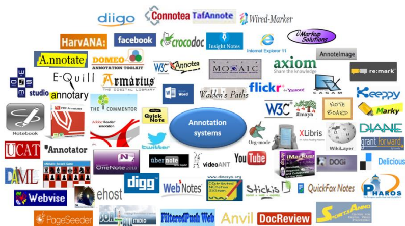
Fig. 1. Several annotation systems are developed in different contexts.

Annotation systems have been developed since the 90 th to transpose on electronic document the secular practice of annotation. Then, these systems have gradually taken advantage of processing capabilities and communication of modern computers to enrich the practice of electronic annotation [20]. An annotation system or still called annotation tool or “annotateur”, is a system allowing users to annotate various types of electronic resources with different kind of annotations [29]. Many researchers have been interested in the creation of annotation tools to facilitate the annotation practice of the annotator in digital environment. We can find numerous commercial software and research prototypes created to annotate electronic resources (see Figure 1).