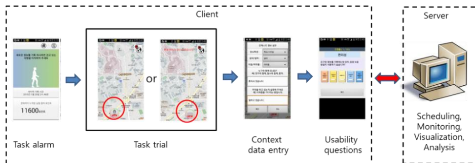
Fig. 1. The overall process of ESM based A/B testing of two interfaces (using the voice or text input) for a simple mobile map logging application.

The participants were scheduled in a balanced order to fulfill a task, either using the interface A or B, and make answers to usability and gold standard questions. Due to the difficulty in inferring particular usage contexts automatically (e.g. whether a person is moving, in a meeting, at a bus station, sleeping, etc.), the data solicitation was done according to a regular time schedule rather than invoked by automatic context detection. Figure 1 shows the overall flow of the ESM A/B testing process.