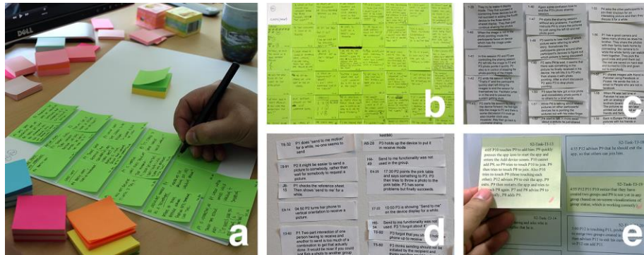
Fig. 1. Creating affinity notes. (a) Writing notes on sheets of A3 paper, (b) handwritten sticky notes, (c) digital notes printed on paper, cut with scissors and attached with tape, (d) digital notes printed on labels, and (e) manually printed sticky notes.

Handwritten Sticky Notes. We begin by placing a stack of sheets of A3 paper on our desk (Fig. 1a). These sheets are used as a canvas onto which to stick notes. A3 is a comfortable format to work with while writing affinity notes; it is large enough to put several sticky notes on it, and small enough to fit on a desk in front of a computer. Traditionally, standard 3x3 or 5x3 inch (7.6x12.7 cm) Post-it notes have been used to write affinity notes. However, we have found those sizes to unnecessarily increase the overall size of the affinity wall and thus the amount of walking for the affinity team members. Moreover, larger affinity notes invite more verbose expressions from the note takers. Therefore, we use the smaller 2x2 or 2x1.5 inch (5.1x3.8cm) sticky notes, which are available in different brands, colors, and slightly different sizes (Fig. 1a). These smaller sticky notes fit in a grid of 8 by 6 notes, totaling 48 notes per sheet.