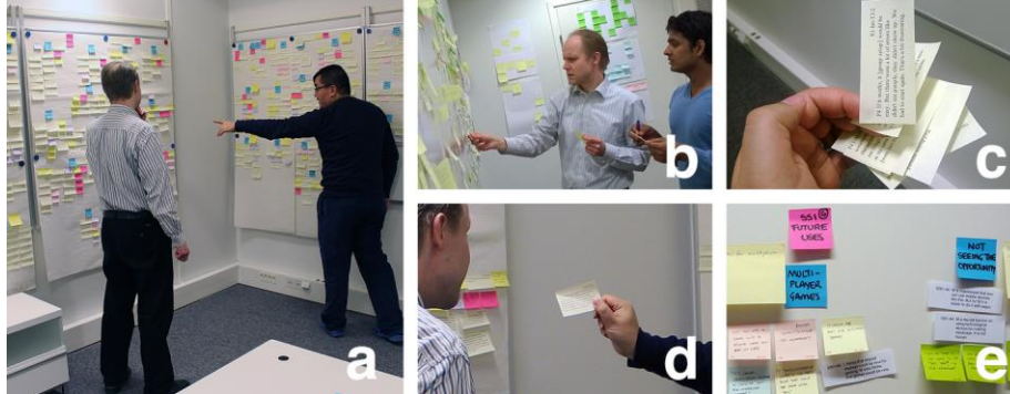
Fig. 3. Walking the wall. (a) Affinity notes have been moved the A3 sheets of paper to form the affinity wall, (b) people slowly start discussing the contents of each category, (c) moving several notes at a time when there are enough categories, (d) verbalizing the act of moving a note to the wall, and (e) user statements in first person are written on larger yellow sticky notes.

Adding Notes to Existing Clusters. As was mentioned earlier, the affinity team will switch back to reading affinity notes from the A3 sheets of papers in between rounds of discussing and pruning the wall. As the affinity wall progresses, team members will be more familiar with the existing clusters and have a better understanding of where a given note could be put up on the wall. As a result, people will evolve from moving one note at a time to the wall, to several simultaneously (Fig. 3c). Each finger can represent a cluster, and several notes can be placed on each finger, and thus ten notes can be moved to the wall at the same time. Another phenomenon that we have observed at these later stages of the process is that team members are more open to verbalize the act of moving a given note up to the wall (Fig. 3d). -“Listen to this note [reads the note aloud]. It goes here.” - “Yes.” Such actions are performed to confirm that existing categories remain valid also after new bits of data are added to the wall.