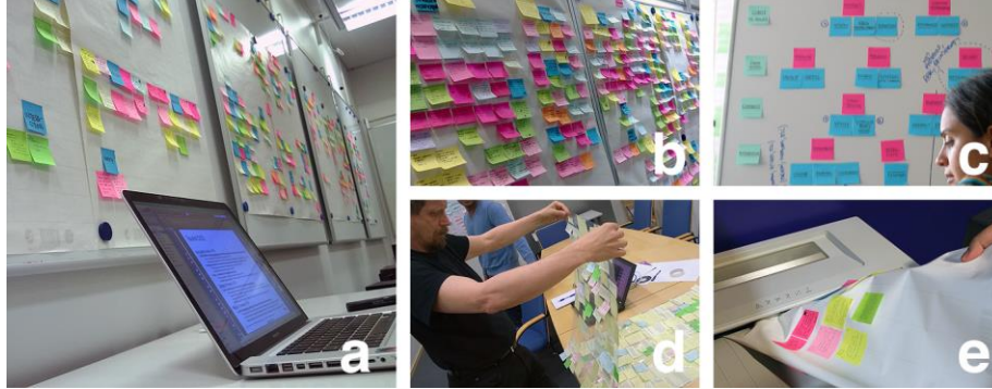
Fig. 4. Documenting the wall. (a) Digitally recording the wall using a laptop, (b) a final affinity wall with pink and blue labels, (c) building the final category structure on a whiteboard, (d) cleaning the room to its original state, and (e) shredding the affinity wall.