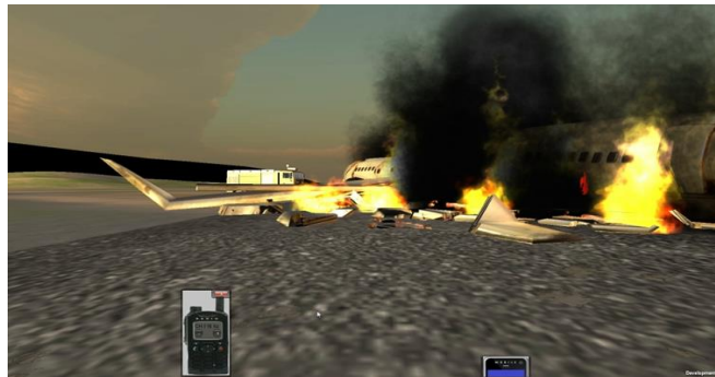
Figure 1 A snapshot of the virtual environment showing the scene of the accident.

Crisis management training is organized and developed according to an accurate predefined system for immediate responses to mass-casualty incidents. First responders are personnel from volunteers to professionals with a few to many years of experience. Professional responders come from different organizations, e.g., rescue, police, medical and firefighting. Training these people to obtain efficient skills is crucial.