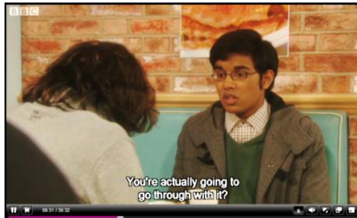
Figure 1 BBC iPlayer's screenshot showing subtitles.