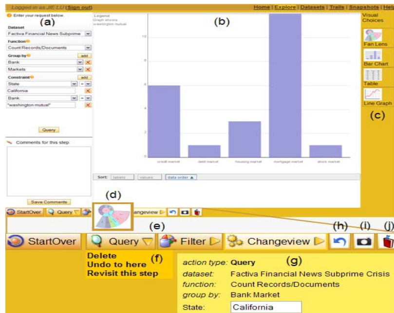
Fig. 1. Smarter Decisions user interface: (a) query panel, (b) visualization canvas, (c) alternate visualization choices, (d) thumbnail of the visualization for a step, (e) trail steps, (f) menu of operations for a step, (g) detail of the action performed during a step, (h) undo, (i) snapshot, (j) bookmark.

In this section, we provide a brief overview of Smarter Decisions , a visual analytic tool within which the analytic trail technology was implemented. Smarter Decisions is an interactive web-based tool for visual analytics designed to help business users derive insights from large collections of both structured and unstructured data. Fig. 1 shows a screenshot of its main user interface for data analysis. The left hand side of the screen is the query panel where users can build a query using select-lists to retrieve the data (Fig. 1a). The middle portion of the screen is the visualization canvas where the retrieved data is visualized (Fig. 1b). Users explore and analyze data by issuing ad-hoc queries and interacting with the visualizations of the retrieved data (e.g. panning, sorting, filtering). Smarter Decisions currently includes several commonly used visualization metaphors such as bar chart, line graph, scatter plot, table, document list, and tag cloud. Based on the technology described in [8], Smarter Decisions assists users by automatically instantiating the data in the most appropriate visualization metaphor given the properties of the data, and provides alternate visualization choices on the right hand side of the screen (Fig. 1c). Users can switch to any of these alternates simply by clicking on them.