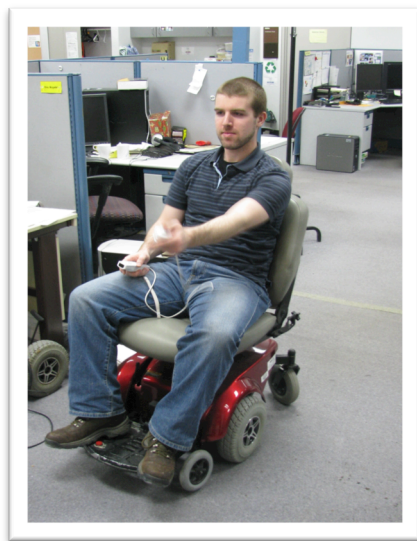
Figure 1A. Seated Platform

We have designed two prototype vehicles, a sitting (Fig. 1A) and a standing platform (Fig. 1B), both of which are based upon an electric wheelchair structure. We chose an electric wheelchair because it is already viewed as a personal vehicle, it was easy to modify for our needs, and electric wheelchairs have the ability to operate in many different environments. That is, they are not constricted by legal issues in the same way that a Segway™ or an automobile is.