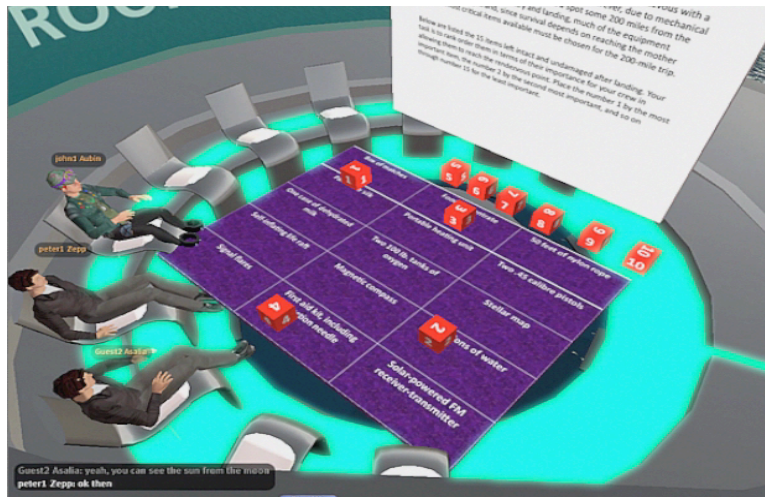
Figure 1b. Screen dump showing SecondLife with group discussion

Voice communication was not used, since we wished to focus on the avatar versus conventional UI interaction, rather than compare communication modalities. Furthermore text chat is commonly used in SL when audio output can be annoying in public contexts such as co located class with several groups. Text communication had the added advantage of recorded transcripts of conversations for qualitative analysis. No verbal or FTF visual contact was allowed in either the BB or SL conditions.