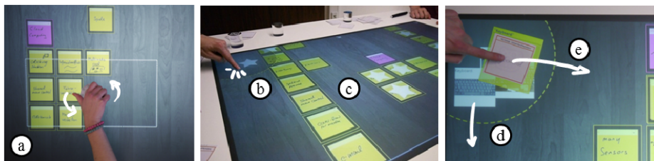
Fig. 4. Focusing on a specific region in the workspace (a); searching for notes (b,c); retrieving and adding images based on the content of notes (d,e).

Highlighting and Focusing. During discussion, deictic references on notes are often used as a form of communication and for coordination in the group (see Fig. 1, d,e). AffinityTable augments these interactions by providing additional functionality. When touching digital notes, they are highlighted around their border with a glowing effect. Each highlight fades out after five seconds. When clustering notes, the fading glow implicitly communicates a history of actions. In addition, a token can be used to focus on a specific region within the workspace during reflection (DG3). By turning the token (see Fig. 4, a), the users can change the zoom-factor of the magnified region displayed on the vertical display (see Fig. 2, right). We chose a single tangible element as focusing tool because we believe its limited accessibility may stimulate negotiations about the focus of discussion.