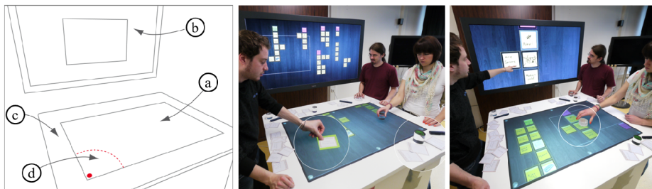
Fig. 2. AffinityTable combines different workspaces by using digital pen & paper, an interactive table with tangible tools and a coupled, high-resolution vertical display.

AffinityTable was designed in an iterative design process. In a first step, a workspace was developed to address the findings from our study. In a second step, specific hybrid interaction techniques were designed to support and augment the workflow and tasks within affinity diagramming.