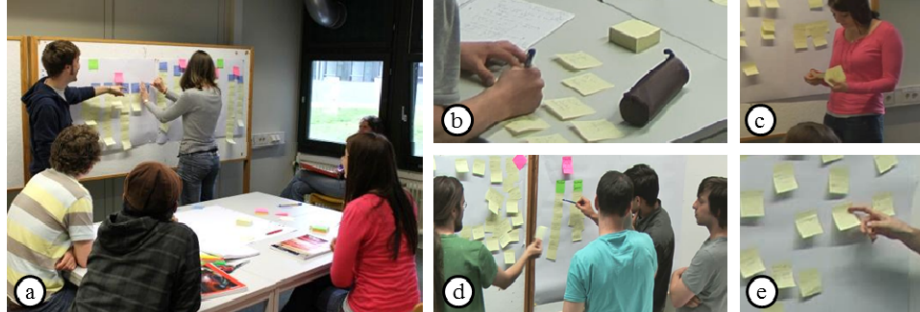
Fig. 1. An observation revealed important characteristics of embodied practice.

Based on our analysis we found that paper artifacts are especially useful during divergent activities, like individual ideation, where a large number of different artifacts are created in rapid cycles. Participants also used paper notes for individual reflection, like flipping through created content to search for inspiration. This is in line with results from a study reported by Cook & Bailey [9] on the use of paper in professional design practice. The authors conclude that paper is highly appreciated due to its unique affordances that support both fluent access and social interactions. Klemmer et al. [2] also emphasize the benefits of paper material for informal design activities. Therefore, we conclude that paper may be used to support individual ideation and reflection activities.