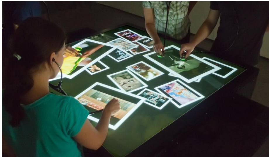
Fig. 2. Multiple users accessing individual auditory content.

Multi-user applications. The described applications easily scale with multiple simultaneous users. Each user is then presented his/her private audio channel depending on the position of his/her stethoscope head identified by his/her own unique visual marker (Fig. 2). Users can listen in to other users' content easily by placing the head of their stethoscope next to that of another user.