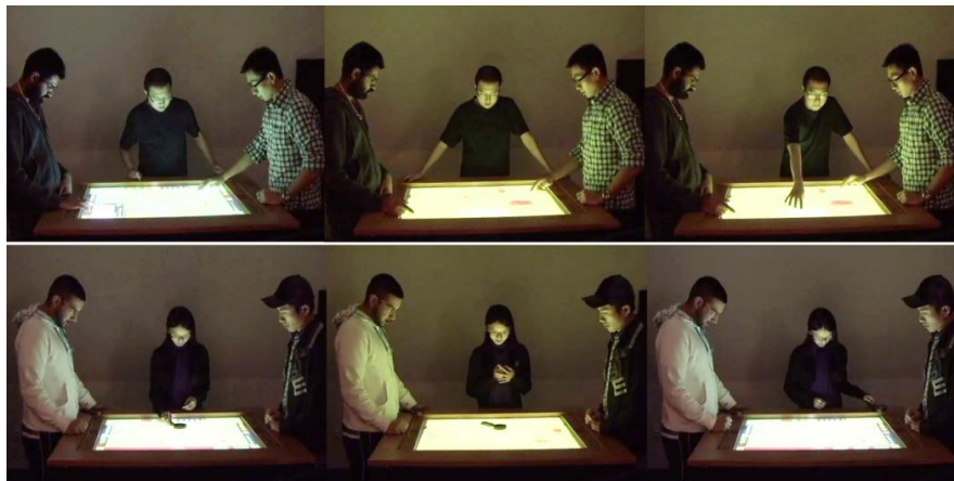
Fig. 6. Initiating and resuming tools is more often done by different players in the MT condition (top); and more often done by the same player in the TUI condition (bottom). For both conditions, from left to right: 1) Player activates impact visualization; 2) Impact visualization is activated; 3) Player resumes the game.

action of picking it up and holding it, which may in turn cause a feeling of ownership. Psychological ownership is defined as the state in which individuals feel an object is theirs [37]. Thaler [36] uses the term “endowment effect” to describe the idea that goods that belong to one’s endowment are valued higher than identical goods that do not. Endowment contributes to a feeling of ownership. When a player picks up and holds one of the TUI magnifying tools, they, and other players, may all sense that the object temporarily belongs to that player. Other players may then hesitate to take action on the object which was placed by, and temporarily owned by, another player. Further investigation is needed to find out whether it is this sense of ownership that inhibits the initiating and resuming of other players, when using physical tools.