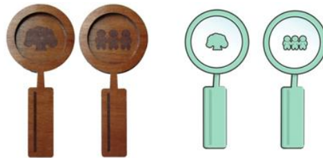
Fig. 2. Tangible (left) and multi-touch (right) magnifying glass tools.

environmental layer, the colour red indicates areas of high damage caused by resources located in those areas. In the population layer, dark pink indicates areas where resources are not efficiently supporting the population.