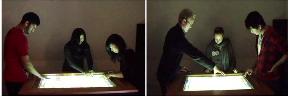
Fig. 7. No tool usage announcing in MT condition (left), clear gesture of tool usage announcement in TUI condition (right).

preparation for placement or to resume play [23]. This visibility may have made people more aware of each other and the tools (Figure 7). When asked why they liked the TUI tools more, some users (6 out of 26) said that they liked being aware of using a physical artifact.