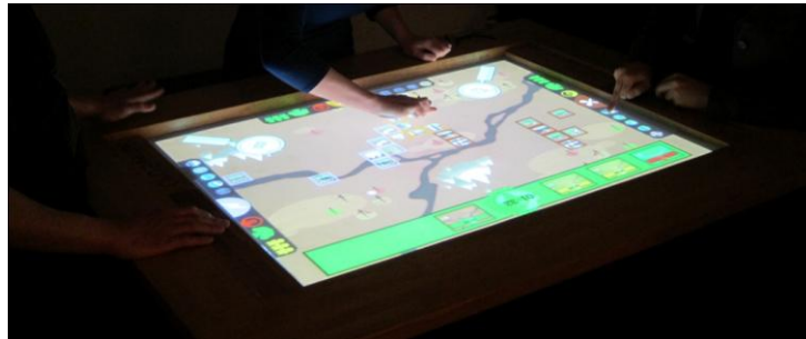
Fig. 1. The Futura game (in the multi-touch condition).

on the world map to support the growing population, but they have to make sure that the resources do not damage the environment. The goal of the game is to balance supporting the population and damaging the environment in a simulated world. The game spans many years and the first version of the game lasts about three minutes. For more details about the original game, see [14, 15]. For a video overview of the Futura project, see http://www.antle.iat.sfu.ca/Futura .