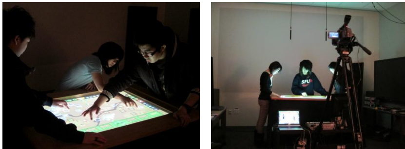
Fig. 4. Playing Futura in groups of three (left). The setup of the user study, showing the Futura game tabletop, three players, microphones, video camera and a additional screen (right).

The mixed methods study design involved collecting data about demographics, game performance, tool use behaviors, player opinions, as well as observations of interaction and play patterns. Quantitative measures included game performance, game scores, and tool use. Tool use data was analyzed for both frequency of occurrence and temporal patterns of usage. In the questionnaire, we asked about learning outcomes, collaboration and tools use. For example we asked the participants if they used the magnifying glasses (TUI and MT) to play the game and if they collaborated with others. We also asked participants if they thought the physicality of the tools made a difference. We used both open and closed questions, the latter ranked with a 7-point Likert scale. We analyzed numeric data with Wilcoxon test to compare the difference of two means, since the data involved repeated measures and included non-Normal count data and ordinal Likert ratings.