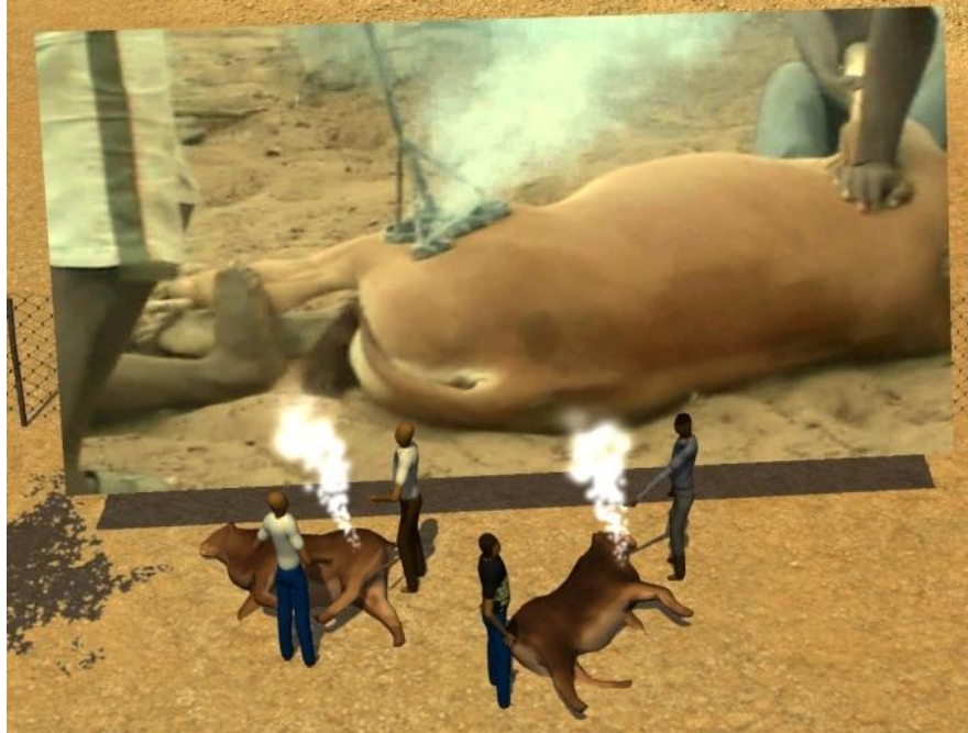
Figure 3 Scenarios act as triggers to launch a video as a 2D plane in the visualization. Here the scenario includes Elders transferring information on branding cows and maintaining the herd.