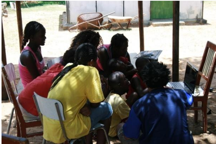
Figure 4 We demonstrated the system to seven younger rural-to-urban migrants.

and ‘read’ the visualization and interpret objects using a tilted camera perspective. For instance, some of the youth recognized the 3D representation of the house outside which we conducted our evaluation: “ This is here. It is this house. ” Afterwards, they explained that they recognized it from the sides of the house and the fires in front of it. When participants panned over the cattle-branding scenario they mentioned, immediately, the branding irons, smoke and cattle, and then watched a video on branding cattle. Thus, we asked if the scenario was a story and they replied that the cattle were in the kraal (corral) and that because a man was pointing this indicated that he (the model) was telling a story. Another interesting discussion ensued after a youth panned over a scenario about slaughtering a goat. To begin with participants vacillated: “ It’s a goat. It’s a sheep. ” but then suddenly agreed that sheep do not have small tails. We interpret this ambiguity as indicating both the importance of photo-realistic quality and, that the users’ and developers’ emphasis on specific visual details differs. That is, we (Author 1 and 4) emphasized man-made objects but not the very fauna that make for local livelihoods and settings.