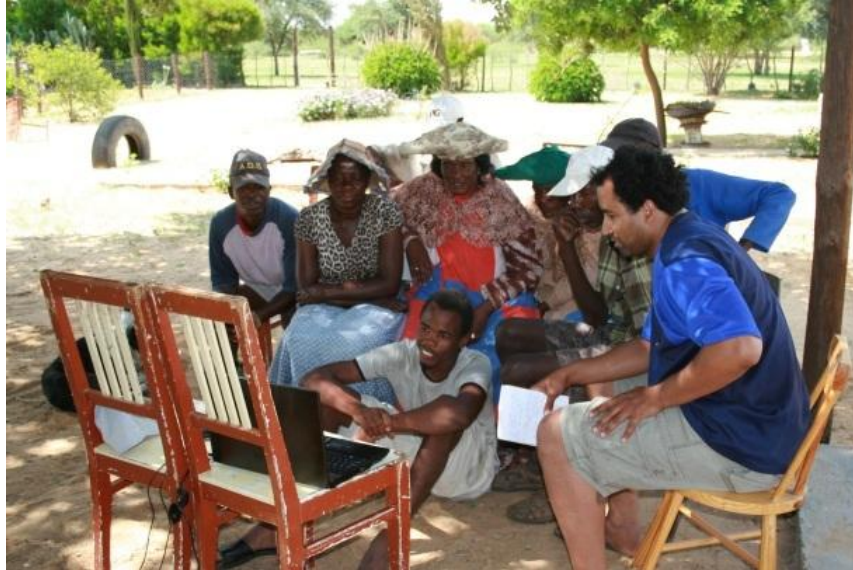
Figure 5 We demonstrated the system to 8 rural residents including 2 Elders.

The Elders observed the resemblance between the visualization and where the evaluation occurred; however, commented on the visual accuracy of the features. For instance, when discussing the scenario near the cattle in the kraal, the Elders told us that planted trees do not grow inside the kraal and added: “ It’s not a planted tree, it’s a wild tree (Otjindanda), just look the way it grows! ” Our (the developers) unfamiliarity with local culture and environment meant we lacked an appreciation of visual differences between cultivated and wild trees or where they might grow and made many assumptions when we drew upon reference images. Our lack of visually differentiating trees made the setting less legible to the Elders. This indicates that they not only understand the visualized objects but also recognized the importance of placing objects. Lack of visual accuracy sometimes caused the Elders’ frustration and uncertainty about their own memory of the setting; for instance, based on photos we modeled one block of concrete, where villagers lay their fire, in front of a house. However, this hut has two blocks of concrete.