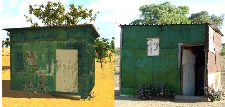
Figure 2 The house on the left is a 3D visualization of the right.