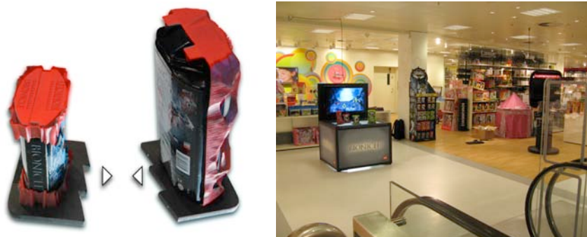
Fig. 7. (A) The matching base profiles (B). The LEGO Table at the department store.

The LEGO Table is an interactive table, designed to market LEGO Bionicle figures in a retail setting ([27]). The physical design of the LEGO Table comprises an interactive surface, a thirty-five-inch monitor, and four boxes with Bionicle figures (Fig. 6). The content consists of the four Bionicle figures: The two heroes, the large Lewa Nuva, and the smaller Tanma, in green, and the two villains, the large Radiak, and the smaller Antroz, in red. The digital content is a high-quality animation associated with each of the four figures, each of which can stand, walk, hover, fly, and fight. Moreover, Tanma can connect to the back of Lewa Nuva, and Antroz can connect to the back of Radiak. The interaction works in the following way: When a physical Bionicle figure is placed on the table, a corresponding animated figure appears on the display, and as the figure is moved on the table, the digital figures moves (either flying or walking) in the virtual 3D world. If a red and green figure approach one another, they begin fighting. Moreover, figures of the same colour have matching base profiles (Fig. 7, A), and when physically interlocked, the small figure jumps on the back of the big figure, in the virtual world. The interaction is implemented using reactIVision software [21], together with visual markers on the bases of each of the boxes.