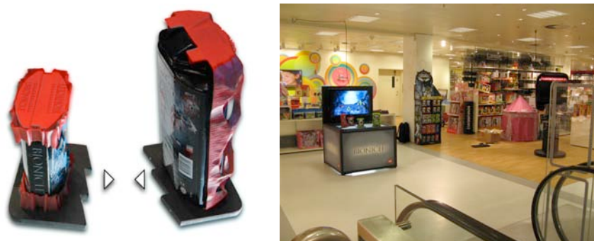
Fig. 7. (A) The matching base profiles (B). The LEGO Table at the department store.

The LEGO Table is an interactive table, designed to market LEGO Bionicle figures in a retail setting ([27]). The physical design of the LEGO Table comprises an interactive surface, a thirty-five-inch monitor, and four boxes with Bionicle figures (Fig. 6). The content consists of the four Bionicle figures: The two heroes, the large Lewa Nuva, and the smaller Tanma, in green, and the two villains, the large Radiak, and the smaller Antroz, in red. The digital content is a high-quality animation associated with each of the four figures, each of which can stand, walk, hover, fly, and fight. Moreover, Tanma can connect to the back of Lewa Nuva, and Antroz can connect to the back of Radiak. The interaction works in the following way: When a physical Bionicle figure is placed on the table, a corresponding animated figure appears on the display, and as the figure is moved on the table, the digital figures moves (either flying or walking) in the virtual 3D world. If a red and green figure approach one another, they begin fighting. Moreover, figures of the same colour have matching base profiles (Fig. 7, A), and when physically interlocked, the small figure jumps on the back of the big figure, in the virtual world. The interaction is implemented using reactIVision software [21], together with visual markers on the bases of each of the boxes.