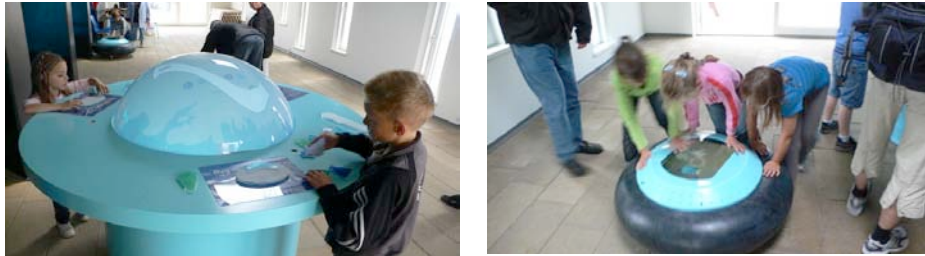
Fig. 2. (A)Visitors constructing fish based on a physical construction kit and (B) exploring the virtual ocean using the Hydrosopes (right).

Our second case derives from our work in the Interactive Experience Environments (IXP) project, aimed at exploring novel interactive installations for museums and science centres. Specifically, we focus on a prototype designed for the Kattegat Centre, which is a marine centre displaying marine life from all over the world. The centre is primarily composed of large aquaria with glass sides that allow visitors to explore the variety of marine life. As part of our research efforts, we designed a prototype installation for the centre, where visitors were invited to construct fish for a virtual ocean. Fish were constructed using a physical construction kit with embedded RFID chips. The construction kit contained the heads, bodies, fins, and tails of a variety of existing species of fish. From these pieces, visitors could create imaginary fish that combined qualities of existing species (Fig. 2, A). After visitors created the imaginary fish, they were invited to release their fish into a virtual ocean that was inhabited by the fish created by other visitors. The only way to explore this ocean was by using digital Hydrosopes (Fig. 2, B). The hydrosopes provided a view into the virtual ocean, which could be explored by pushing the Hydrosopes along the floor.