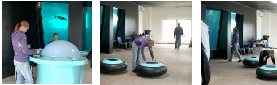
Fig. 3 (A) The girl moving between the construction table, (B) the Hydrosopes and (C) the large aquarium.

There are several things worth noting, with regard to the elements of engagement described in the previous section. During the first part of the user's interaction (Fig. 3, A), the girl is using the construction table by herself, and goes back and forth between the Hydrosopes and the construction table every time she has constructed a fish. Finding her own fish in the Hydrosopes inspires her to create new fish, which in turn prompts her to explore the digital ocean through the Hydrosopes. After approximately ten minutes, the girl loses interest in the Hydrosopes, walks to the large window of the aquarium, and spends a few moments looking at the fish (Fig. 3, C). After having watched the aquarium for a few moments, the rest of her family enters the room, and her father begins to construct a fish at the construction table. The girl immediately joins her father, and they collaborate on building a new fish. As her father is apparently using the installation for the first time, on several occasions the girl instructs her father on how the installation works (Fig. 4, A). After a few moments, her attention turns to her mother and her younger brother, who are exploring the digital ocean through one of the Hydrosopes. She walks to the Hydrosopes, and spends time moving one of these around with her brother (Fig. 4, B), before returning to the large aquarium windows.