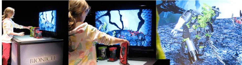
Fig. 6. The LEGO table.

The LEGO Table is an interactive table, designed to market LEGO Bionicle figures in a retail setting ([27]). The physical design of the LEGO Table comprises an interactive surface, a thirty-five-inch monitor, and four boxes with Bionicle figures (Fig. 6). The content consists of the four Bionicle figures: The two heroes, the large Lewa Nuva, and the smaller Tanma, in green, and the two villains, the large Radiak, and the smaller Antroz, in red. The digital content is a high-quality animation associated with each of the four figures, each of which can stand, walk, hover, fly, and fight. Moreover, Tanma can connect to the back of Lewa Nuva, and Antroz can connect to the back of Radiak. The interaction works in the following way: When a physical Bionicle figure is placed on the table, a corresponding animated figure appears on the display, and as the figure is moved on the table, the digital figures moves (either flying or walking) in the virtual 3D world. If a red and green figure approach one another, they begin fighting. Moreover, figures of the same colour have matching base profiles (Fig. 7, A), and when physically interlocked, the small figure jumps on the back of the big figure, in the virtual world. The interaction is implemented using reactIVision software [21], together with visual markers on the bases of each of the boxes.