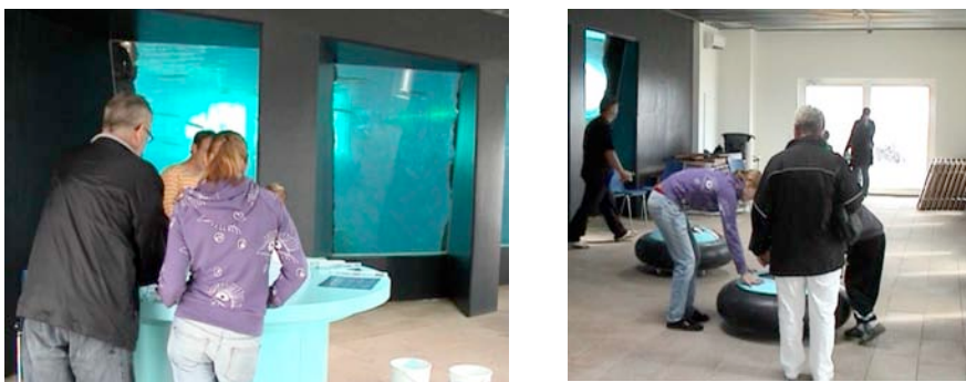
Fig. 4. (A) The girl creating fish with her father and (B) using the Hydrosopes with her brother.

There are several things worth noting, with regard to the elements of engagement described in the previous section. During the first part of the user's interaction (Fig. 3, A), the girl is using the construction table by herself, and goes back and forth between the Hydrosopes and the construction table every time she has constructed a fish. Finding her own fish in the Hydrosopes inspires her to create new fish, which in turn prompts her to explore the digital ocean through the Hydrosopes. After approximately ten minutes, the girl loses interest in the Hydrosopes, walks to the large window of the aquarium, and spends a few moments looking at the fish (Fig. 3, C). After having watched the aquarium for a few moments, the rest of her family enters the room, and her father begins to construct a fish at the construction table. The girl immediately joins her father, and they collaborate on building a new fish. As her father is apparently using the installation for the first time, on several occasions the girl instructs her father on how the installation works (Fig. 4, A). After a few moments, her attention turns to her mother and her younger brother, who are exploring the digital ocean through one of the Hydrosopes. She walks to the Hydrosopes, and spends time moving one of these around with her brother (Fig. 4, B), before returning to the large aquarium windows.