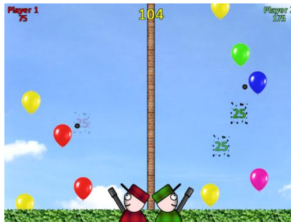
Figure 2. The Balloon Burst game. Player 1 (red) has shot a balloon for 25 points; Player 2 (green) has just shot two balloons for 50 points; 104 seconds remain in the game.

In order to guide players to a safe level of exertion, a maximum pedal speed is set in the game. While the choice of maximum pedal speed is dependent on the user population and their exercise goals, for our experiment we chose an upper limit of 80 RPM based on recommendations for optimal bicycle training [5]. If a player exceeds this maximum pedal cadence, no balloons are launched. Balloons begin to launch again once pedal speed drops back below the maximum. It is therefore in the player's best interest to pedal as close to the maximum cadence as possible without exceeding it. Players receive tactile feedback indicating their cadence through the hand-held gamepad. The gamepad produces a pulsing sensation every time a balloon is