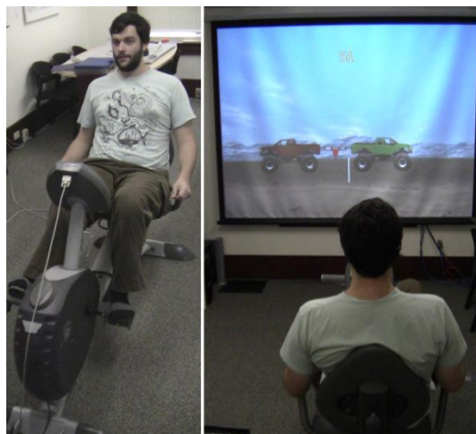
Figure 4. Equipment setup. Left: player pedaling on bike; Right: player's view of the game.

The study was designed to investigate the effectiveness of haptic feedback in exergames, not the long-term exercise efficacy of the games. Therefore, each trial was short, lasting between 1 and 5 minutes. Participants were given time between each trial to cool down and return to a resting state. Following the completion of all six trials, the two participants were brought back into one room for a post-experiment interview and debriefing.