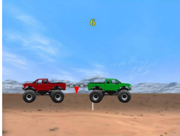
Figure 1. The Truck Pull game. Player 1 (red) has taken the lead with 6 seconds remaining.

Truck Pull: In Truck Pull , two players engage in a virtual tug-of-war by pedaling on their respective stationary bikes. Each player is represented by an on-screen truck. Both players' trucks are connected by a big chain (see figure 1). The trucks move in the direction of the player who is pedaling with the higher cadence. After one minute, the player who has moved the trucks closer to her side of the screen is the winner.